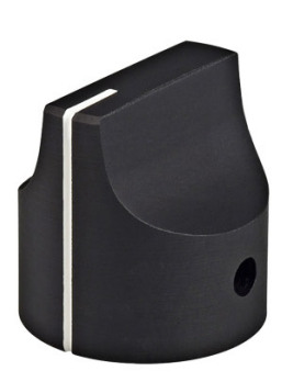
HD-90 - Black