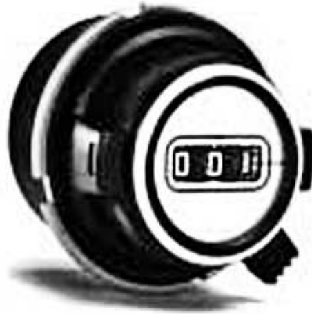
Model 2126 Precision Digital 1" Diameter Turn-Counting Dial

For more information about this product, visit our website at: www.potentiometers.com