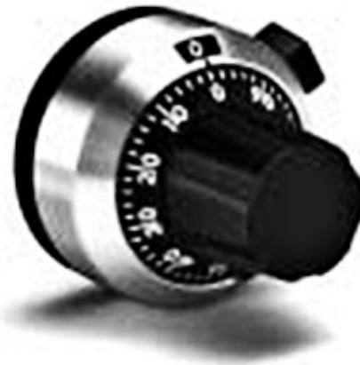
Series 2640 Precision Concentric 7/8" Diameter Analog Turn-Counting Dial

For more information about this product, visit our website at: www.potentiometers.com